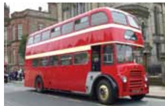
AX05L (2) - Alexander L67R Leyland PD3 Lowbridge