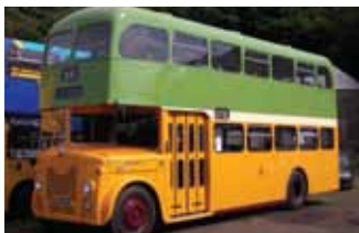
AX04L (1) - Alexander H72F Leyland PD3 Highbridge