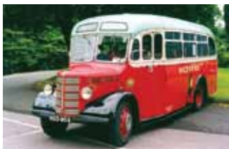
DU02BF - Duple C25F Bedford OLAZ