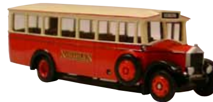
NC01AB - 1926 Albion PK26