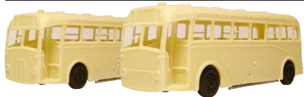
EE01A - English Electric Northern General SE4 Bus This kit comes with alternative front panels for early and late versions