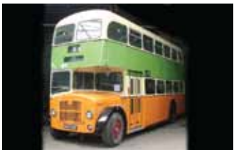
AX04A - Alexander H72F AEC Regent V Highbridge