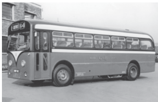
RO01AL (2) - 1950's Roe DP41F AEC / Leyland Dual Purpose