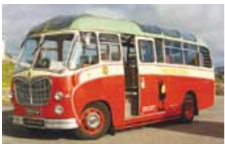
DU01BF - Duple C29F Bedford C5Z