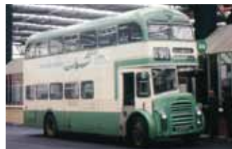
AX04L (2) - Alexander H72F Leyland PD3 Highbridge