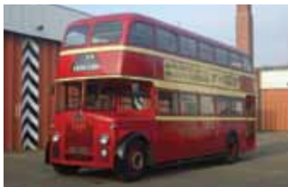
AX05L (1) - Alexander L67R Leyland PD3 Lowbridge