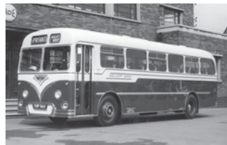
RO02AL - 1960's Roe DP41F AEC / Leyland Dual Purpose