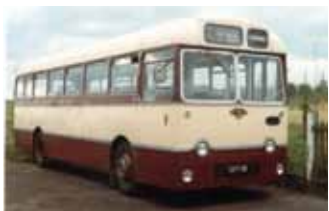
PX02AL - Plaxton B45F Highway AEC / Leyland 30ft