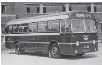
RO01AL (1) - 1950's Roe B45F AEC / Leyland Bus